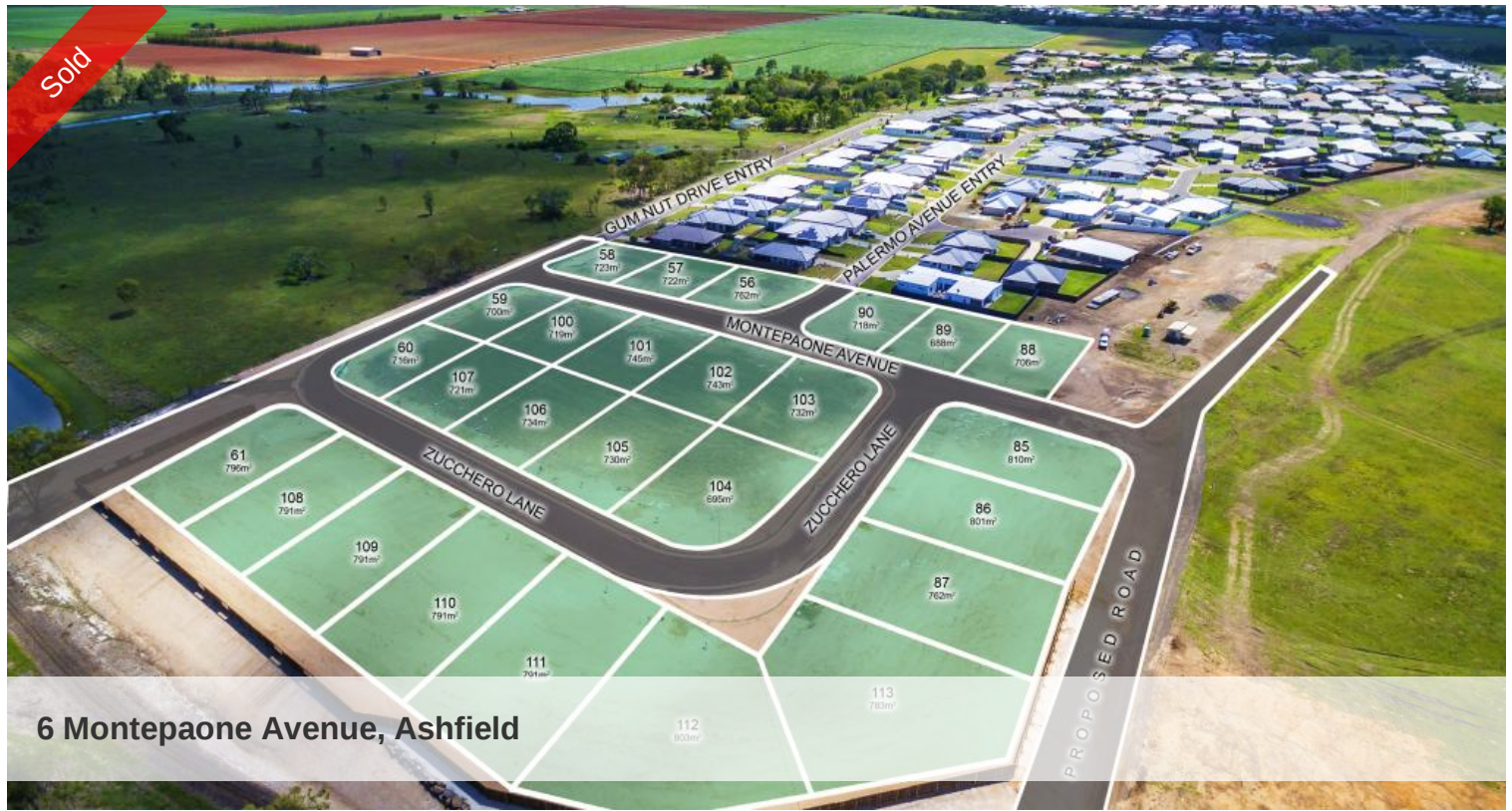
6 Montepaone Avenue, Ashfield