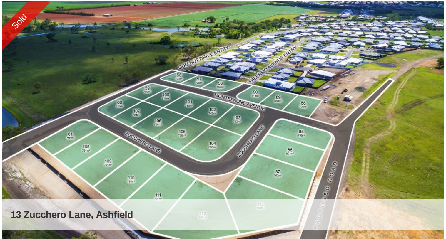
13 Zuccherio Lane, Ashfield