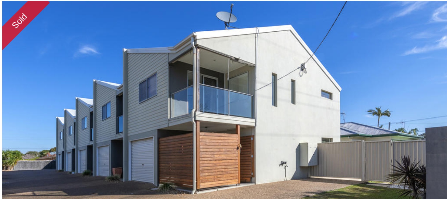
Unit 1, 62 Electra St, Bundaberg West