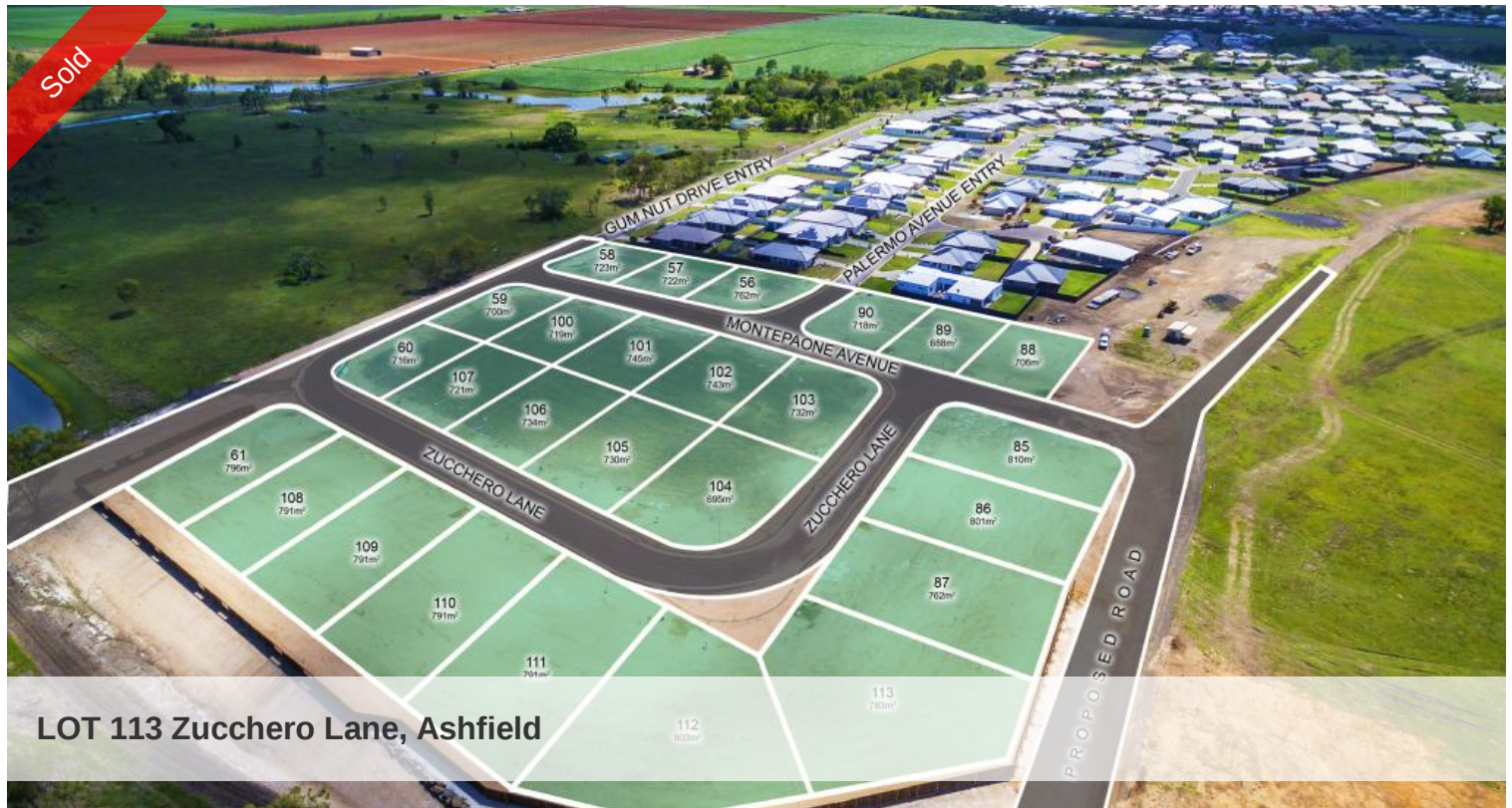
LOT 113 Zuccherio Lane, Ashfield